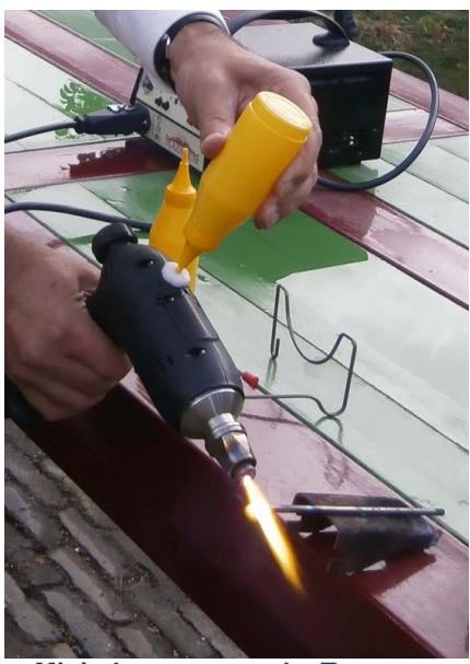
Mini-plasmatron melts Tungsten (3500 oC)