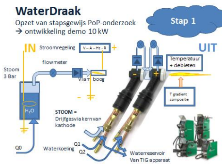
Plasmatron set-up as applied in model calculation